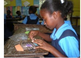
VBS Craft Time